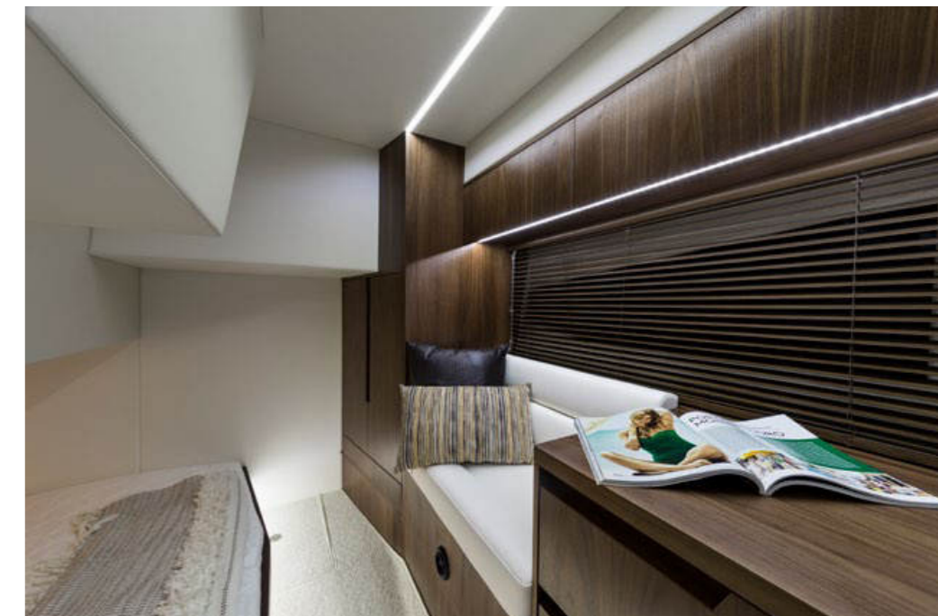
Second cabin with a double bed offers plenty of space