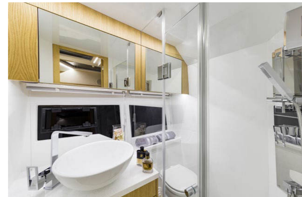
A closed-off shower will help to keep the bathroom dry and tidy