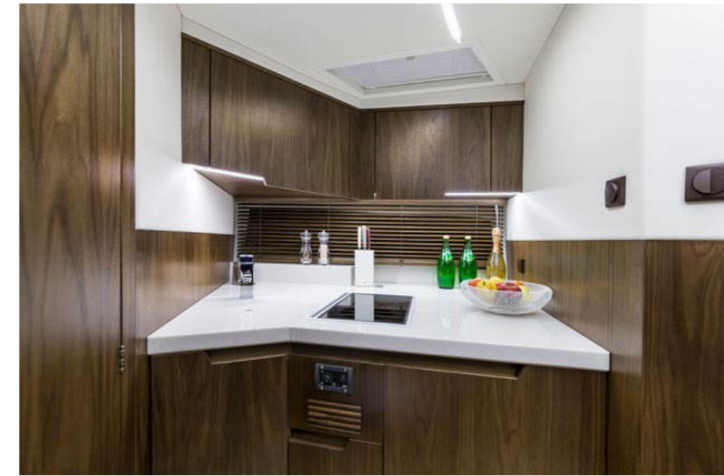
A well equipped galley area