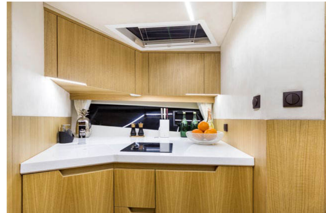
The forward cabin will sleep two

The saloon down below is bright and spacious for a yacht in this segment