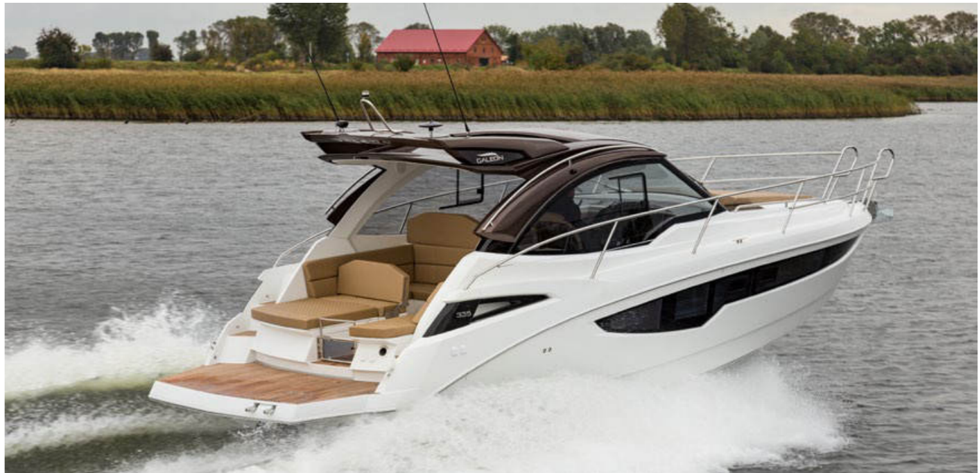
Notice the large bath platform for water based activities