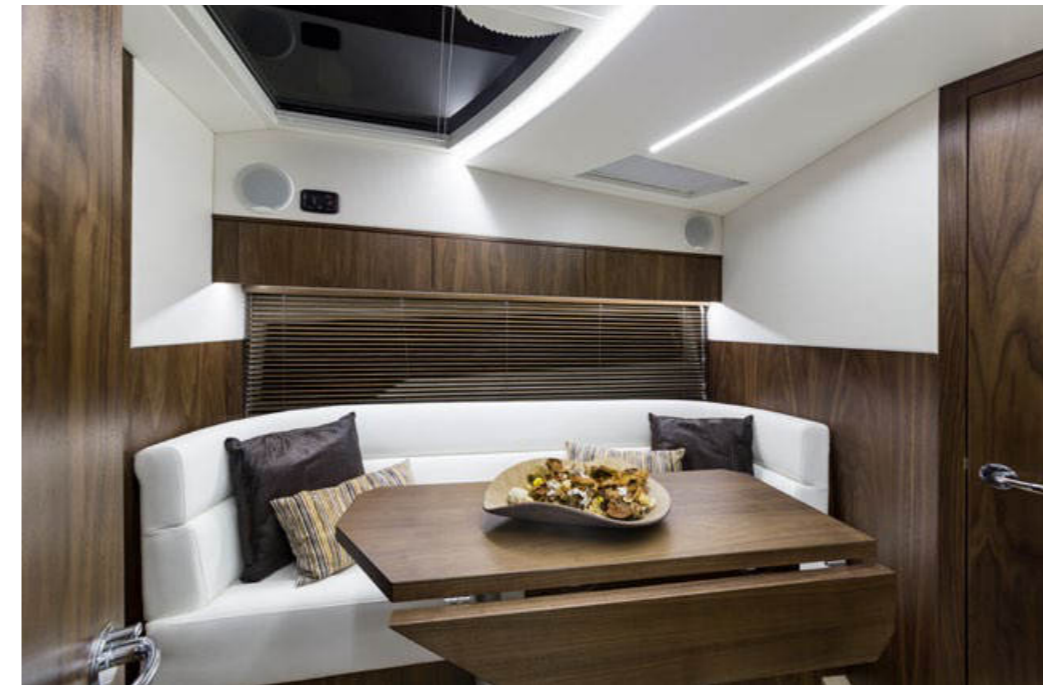
The dining and rest area down below

Below deck find the saloon with galley area and a sizable dinette