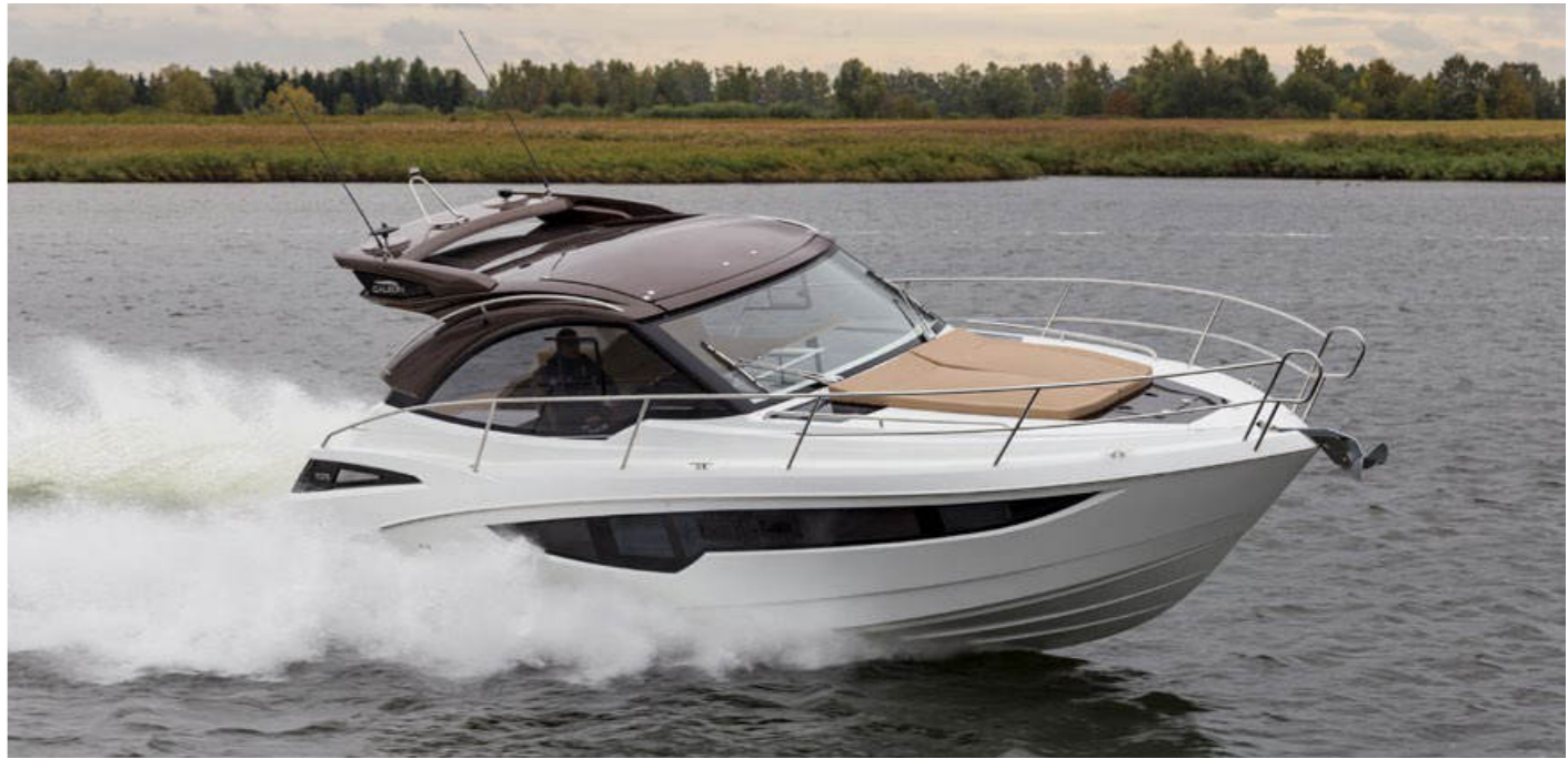
Striking design and smooth cruising of the 335 HTS

A new addition to the Galeon cruiser line-up offers great handling and sport like performance in any conditions