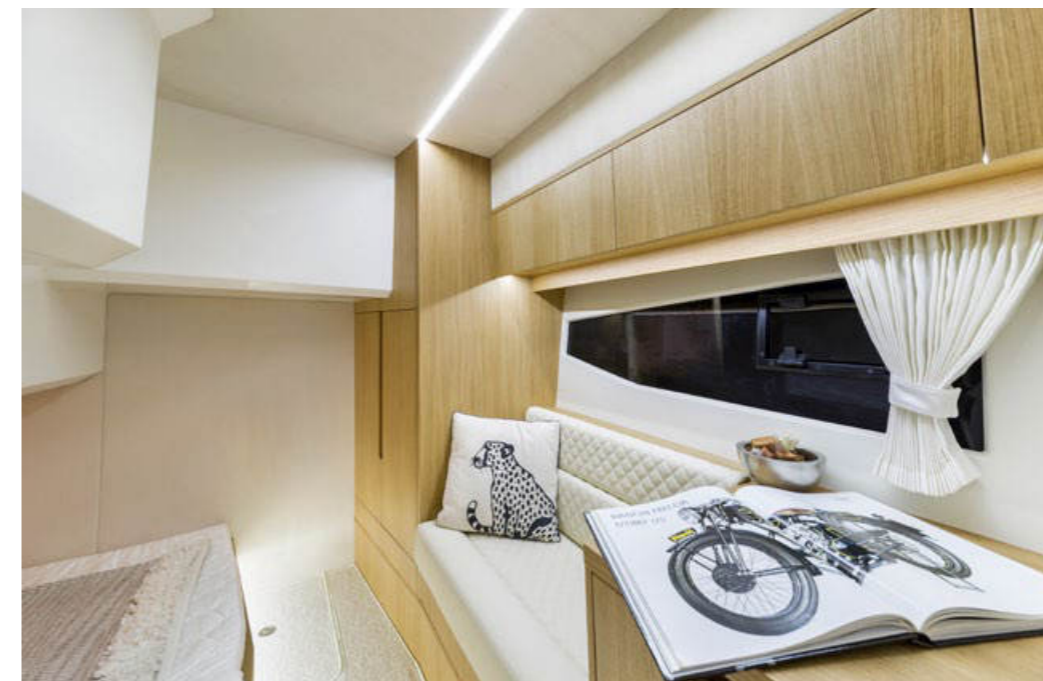
Guest cabin has a large double bed and holds extra storage