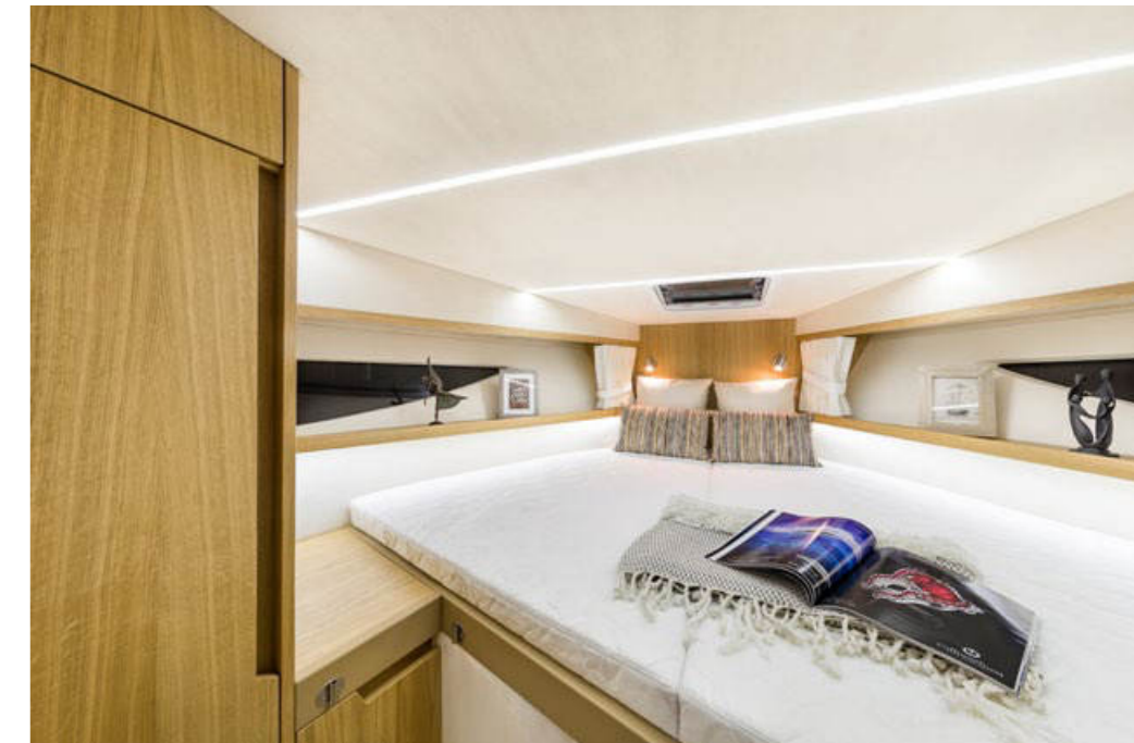
Galley area will hold plenty of supplies