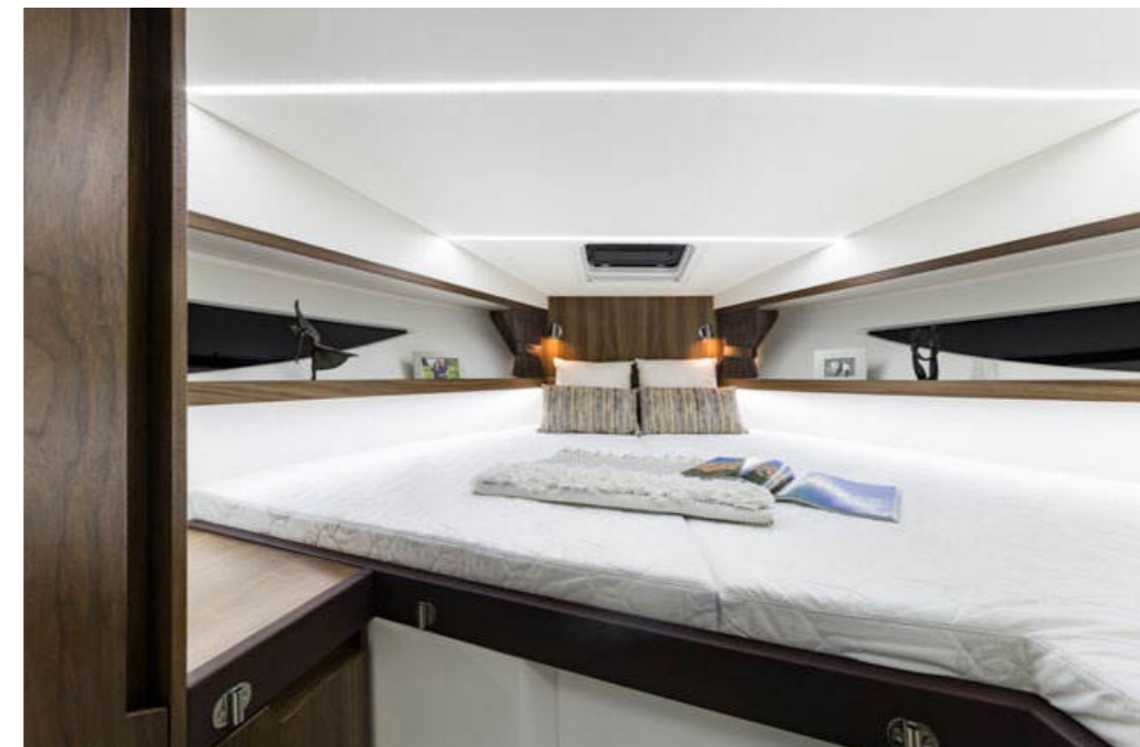
The forward cabin will sleep two with extra space for storage